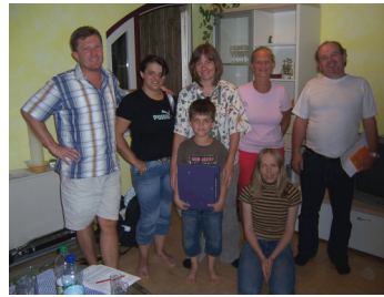
New Believers Cell group

witch craft saw dramatic transformation when she gave her life to the Lord! She is now being disciplined and is growing in her walk with the Lord.