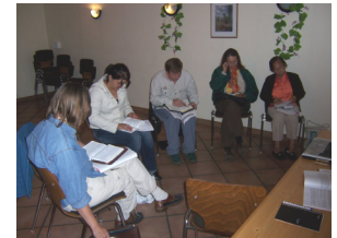
Purpose Driven Life Cell group